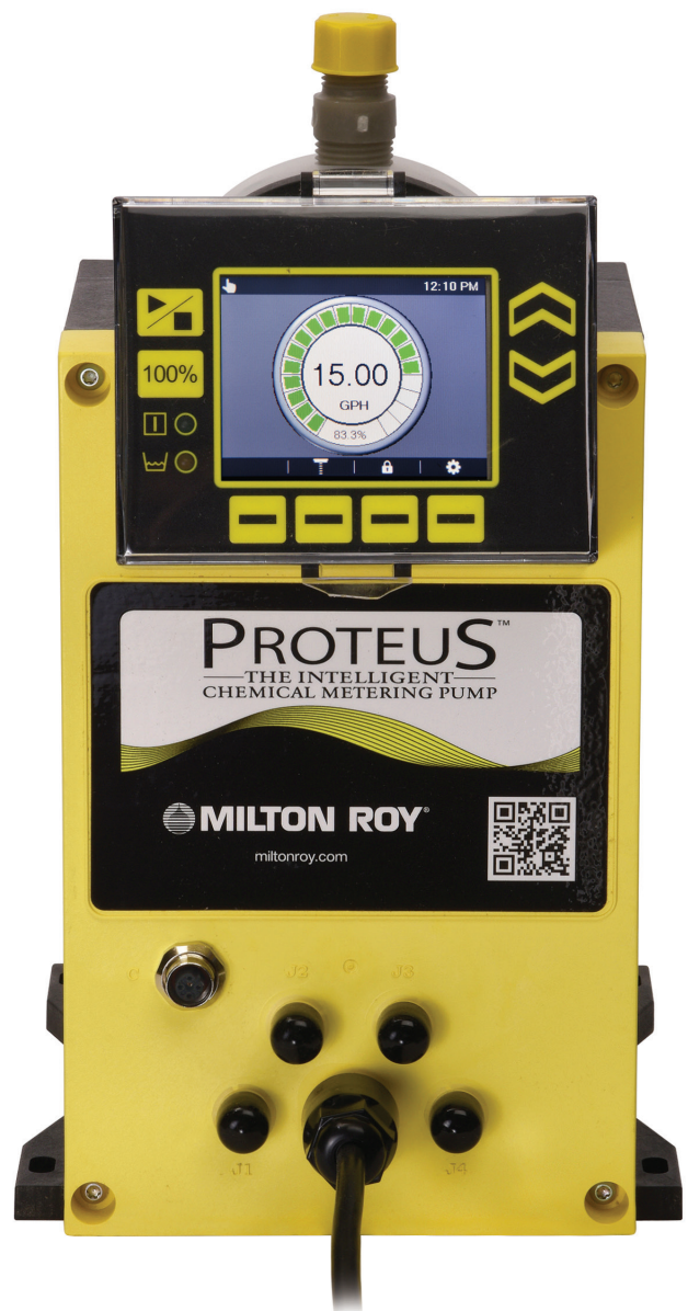
Pictured: PROTEUS Communications model

Selecting the right pump just got easier. No complicated configurations are necessary to find the right pump. With the Manual, Enhanced, and Communications models, simply pick the features that fit your needs (see page 6 for a complete list). Our models offer a wide range of functionality including backlit display, multilanguage, and 2-way communication to name only a few.