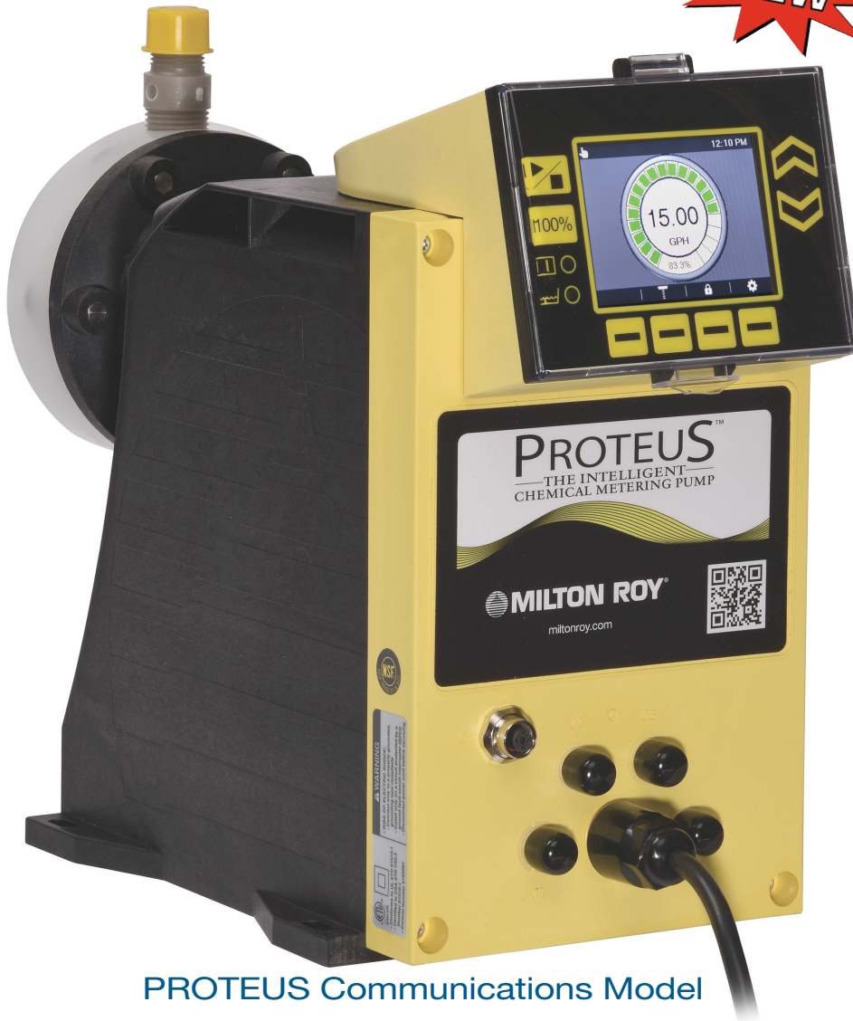
PROTEUS Communications Model